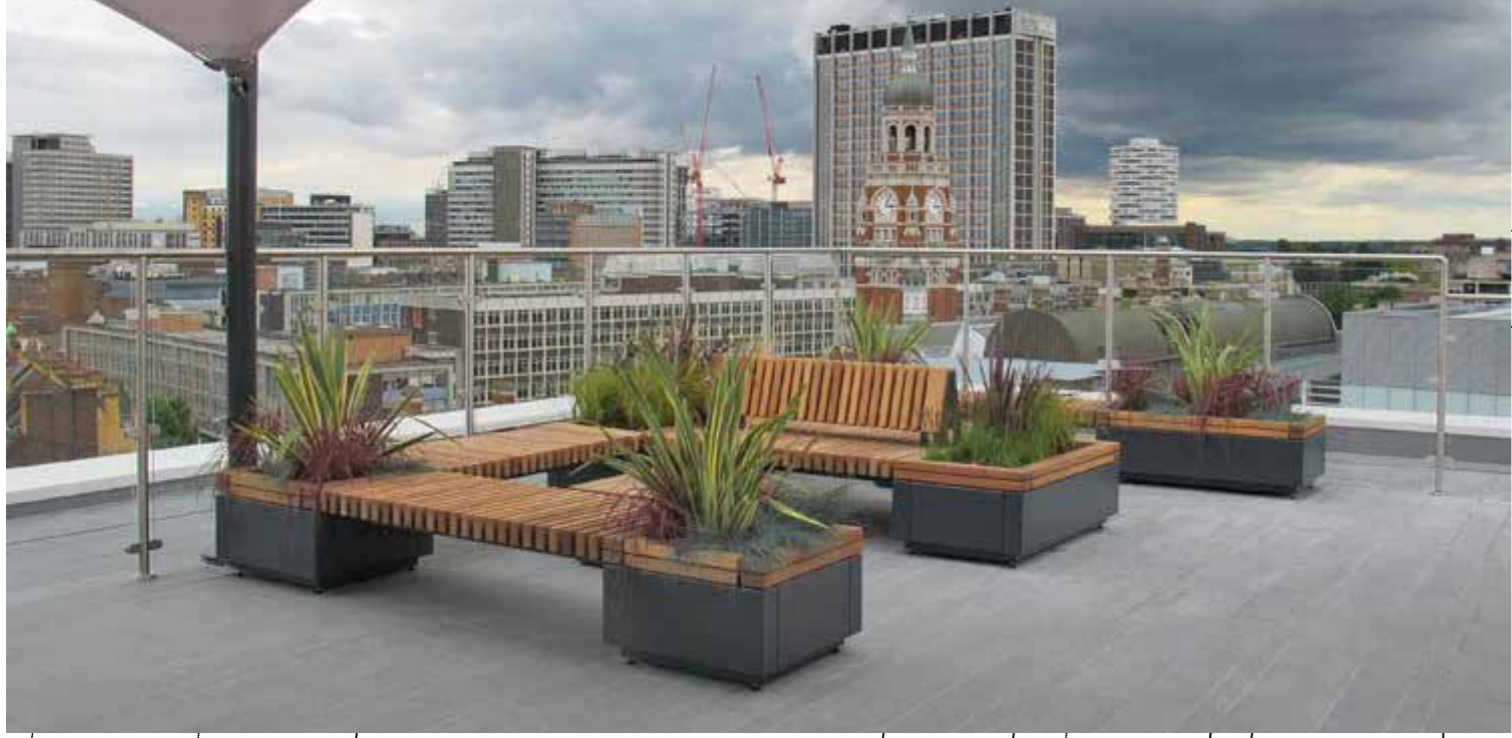
Seating module options